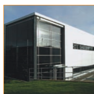
Industrial Oaktree Court Disposal for Madison Land