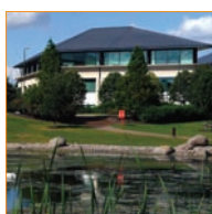
Office Arlington Business Park Disposal for Danka UK